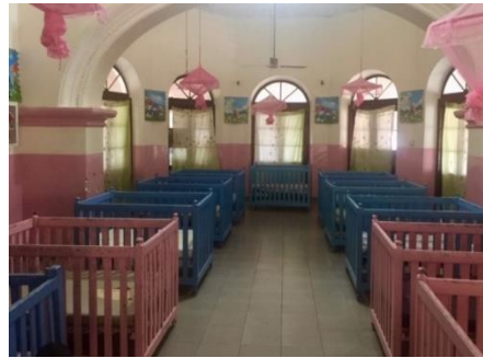
One of the bedrooms full of cots and mosquito nets hanging over them.