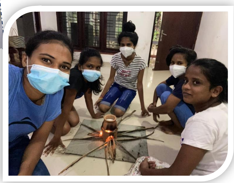
Traditional "new home" welcome ceremony

We have furnished the safe house with new