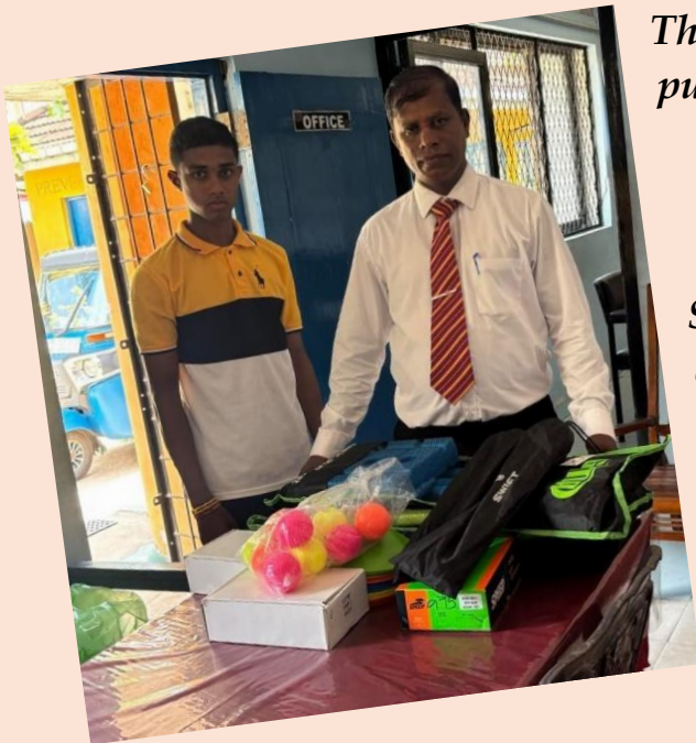
The headmaster with cricket equipment we purchased.