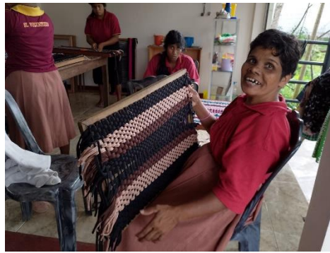
Making bath mats which sell very quickly