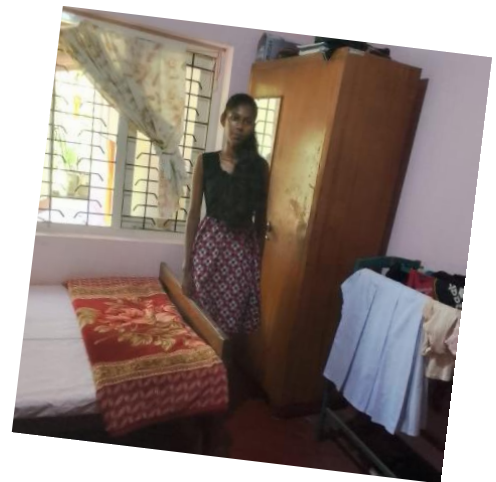
The room is well furnished and comfortable.