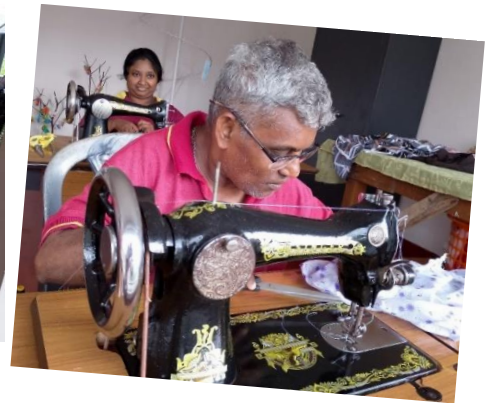
The men enjoy sewing too.