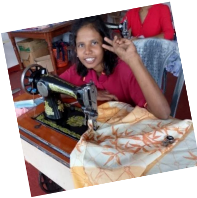
Moshka loves sewing

Sukitha Orphanage - When June visited the orphanage in March, she purchased some of the items they make at the vocational centre shop. These items were sold on the charity stall and the money raised will be sent to Sukitha to enable them to purchase more materials.