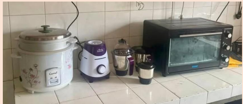
The rice cooker, blender and oven are used every day. The matron has told us that the oven is also used to teach the girls how to cook. Therefore, it has a dual purpose which is great.

All simple items but it means the world to this orphanage.