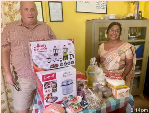
We purchased a blender and rice cooker plus food .

Karuna works hard to assist this orphanage with much needed items to make life easier for the cook to feed all the girls and staff. Some of the items we have purchased include: