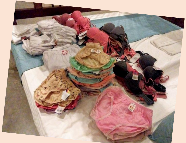
Underwear all ready to take to the orphanage.