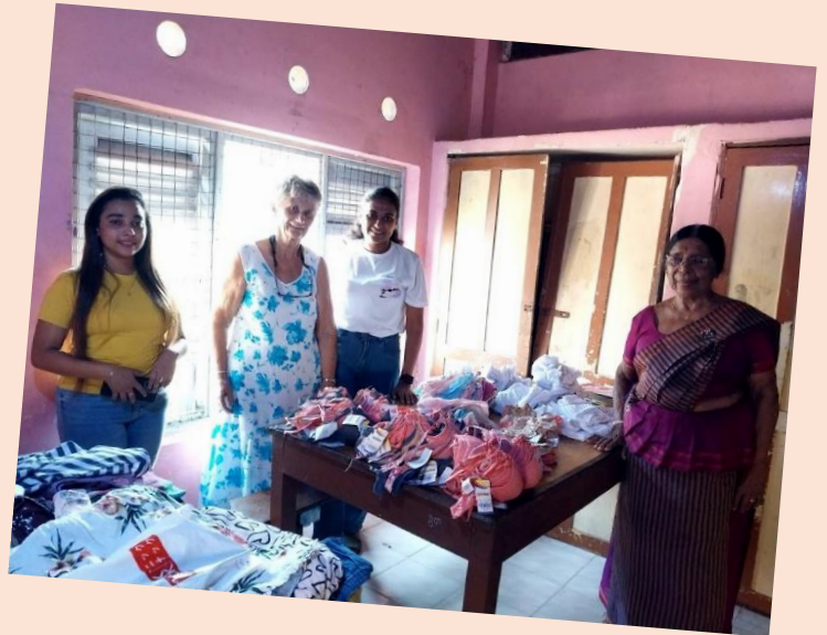
Presenting the underwear for the girls.