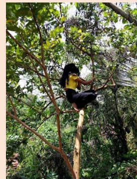
Piyuma could not resist climbing up to pick the guavas.