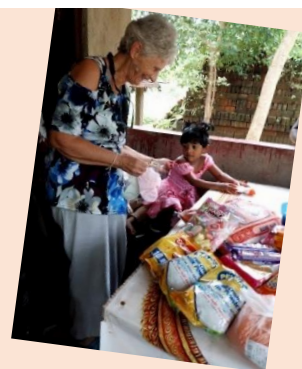
Also, small gifts for the children of course