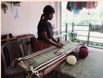
Bath mats are a very popular product made in the vocational centre. The ladies enjoy showing off the bath mats they have made.