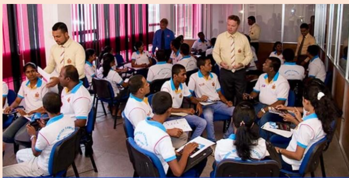
Study groups at work