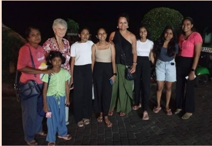
Now all grown up.

It was a very enjoyable evening and the girls, now young ladies, enjoyed chatting to Tamara about their hopes and dreams moving forward