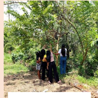
The girls saw some guavas in the trees at the house.