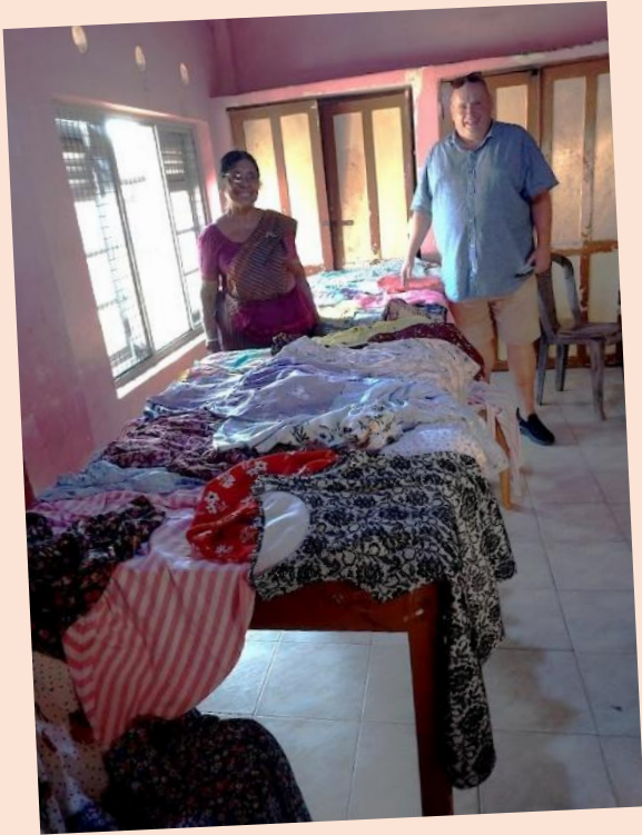
The matron was amazed with the selection of dresses