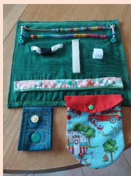
June made this fidget board as a sample to see if it would be suitable for the residents to use.