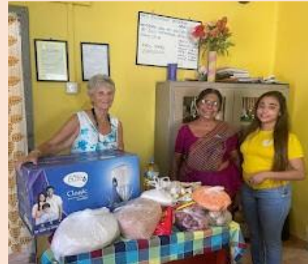
The water purifier and food were very well received