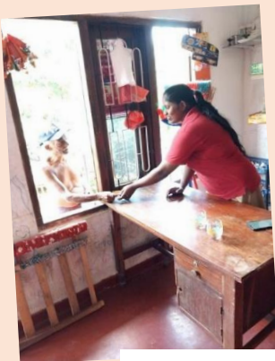
Serving a customer from the shop inside the house.