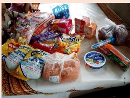
We always take dry foods