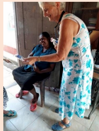
Giving the hand creams to the carers