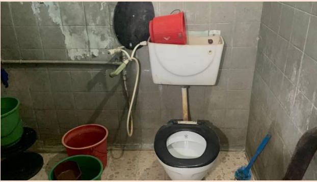
The Old toilet needed replacing

We have been assisting the Moravinna Orphanage in many ways