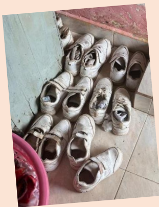
These shoes have seen better days!!

With the assistance of The Free Town Trust in England we have been able to buy new shoes for the girls.