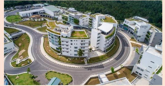
NSBM Green University