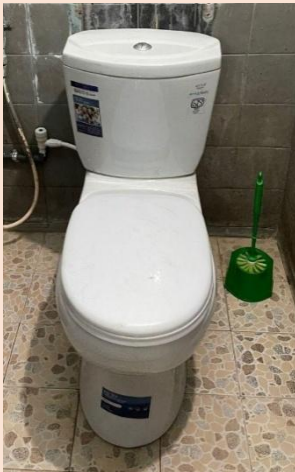
New toilet installed