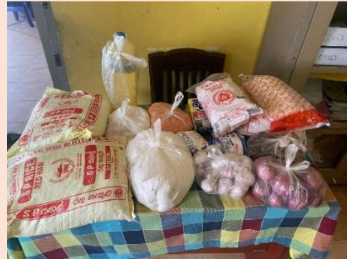
We also supply food and refill a gas bottle every month

With the assistance of The Free Town Trust in England we have been able to buy new shoes for the girls.